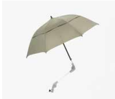
Umbrella V01-V06, V10