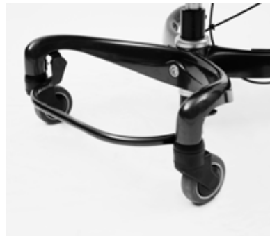
Foot ring E01-E06