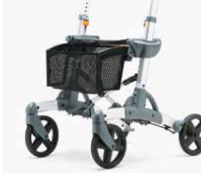
Cloth basket V01-V10