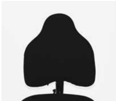
SitRite, back E01-E04, E07-E08, E10-E11