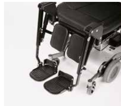
Electrical footrest E07, E09-E10