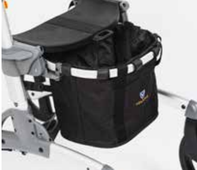
Basket in cloth V01-V02, V04, V06