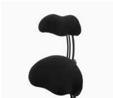
Head restraint, Forma E02-E03, E07, E10