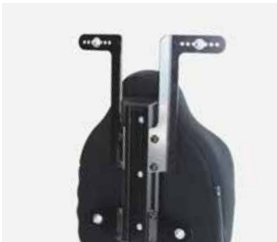
Bracket for harness E02, E04, E07-E08, E10-E11