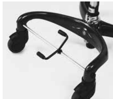
Foot brake E01-E06