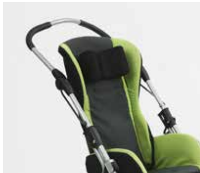
Head restraint A01-A02