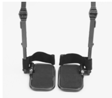
Split footrest E01-E11