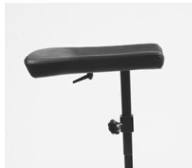
Hemiplegia armrest E01-E03, E05-E07, E09-E10