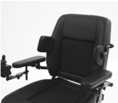
Trunk support, Comfort E09