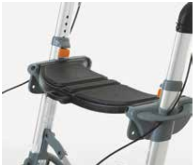
Soft seat V01-V10