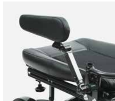
Lift and fold armrest E09