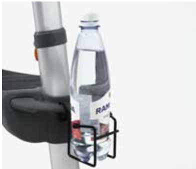
Bottle holder V01-V10