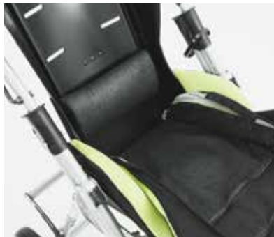
Lower back cushion A01-A02