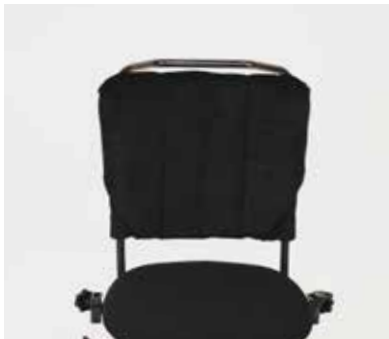
Back, slingback E01-E03, E05, E07, E9-10