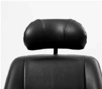
Head restraint E01-E05, E07-E11