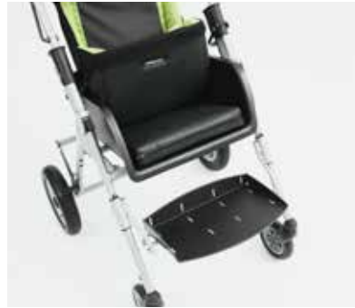
Wedge cushion A01-A02