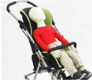
Hand hoop A01-A02