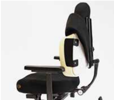
Trunk support reinforcement, SitRite E02, E04, E07-E08, E10-11