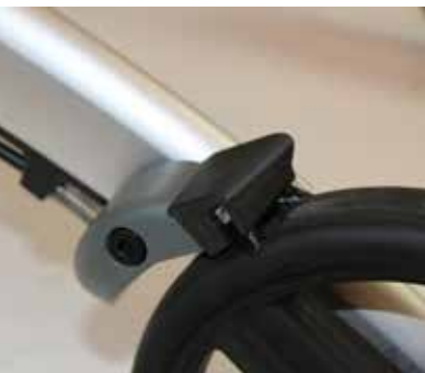
Wheel brush V01-V06, V09-V10