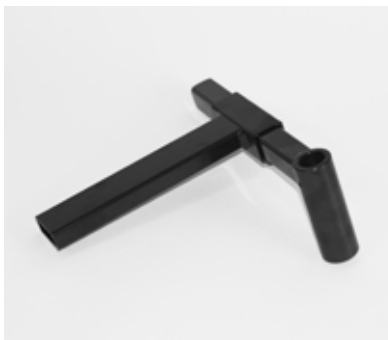
Etac footrest adapter E01-E11