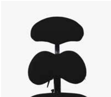
Forma comfort, back E01-E03, E05, E07, E10