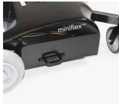
Transport service bracket, Miniflex E10-E11