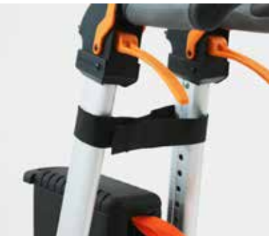
Transport strap V01-V10