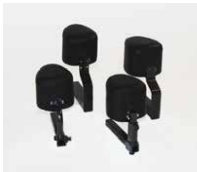
Crotch gussets E01-E05, E07-E11