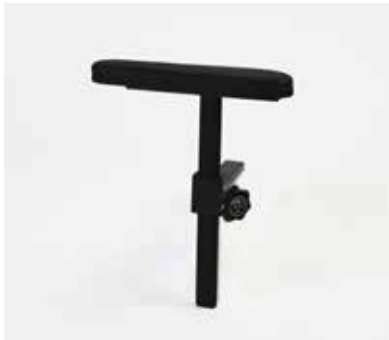
Armrest fixed E01-E11