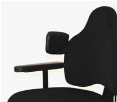
Trunk support E02-E04, E07-E08, E10-E11