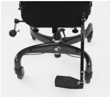
Etac footrest E01-E11