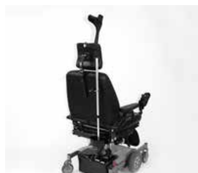
Holder for crutches and canes E09