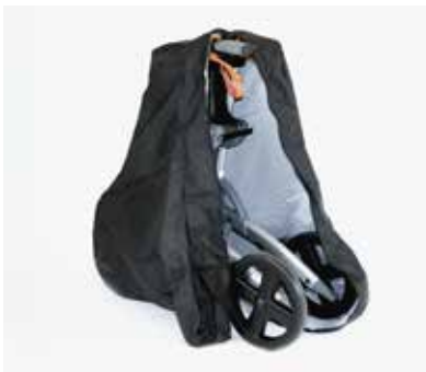
Travel case V01-V06, V10