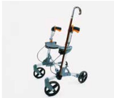
Holder for crutches and canes V01-V10