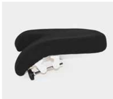
Forma, Coxit seat E01-E03