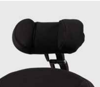
Headrest Comfort II E09