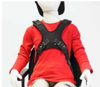
Harness E02-E04, E07-E08, E10-E11