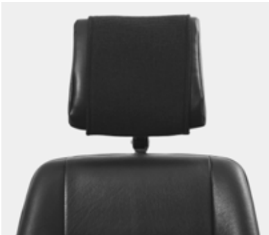
Head restraint, Comfort E09