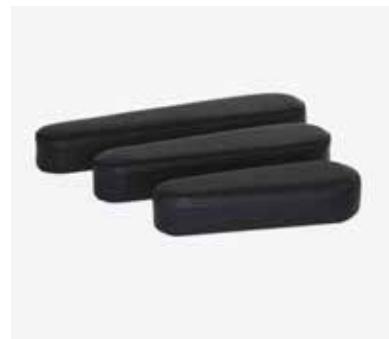
Armrest platform, 5 cm E01-E11