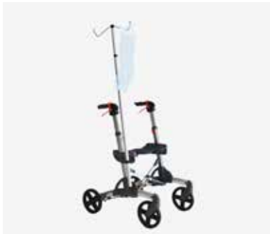
Drip holder V01-V06, V09-V10