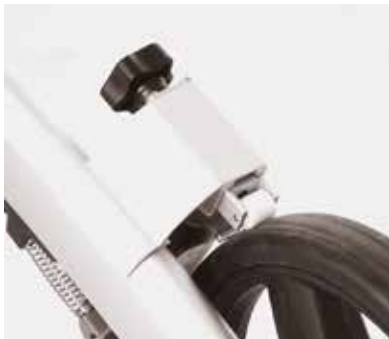
Restriction brake V01-V10