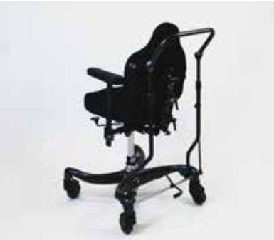
Push handle E01-E05