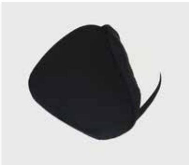
Cover, seat E01-E08, E10-E11