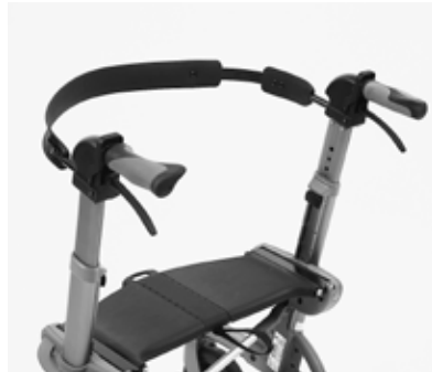
Back support band V01-V08, V10