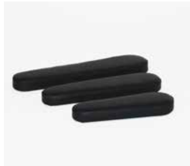
Armrest platform, 3 cm E01-E11