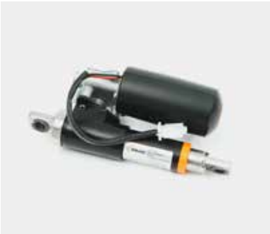
Electrical function, e.g. tilt and back E02-E11