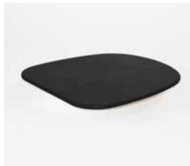
Flat seat E01-E04, E06-E11