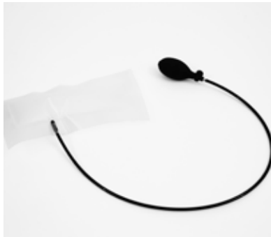
Lower back support, inflatable cushion E01-E11