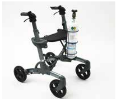
Oxygen cylinder holder V01-V10