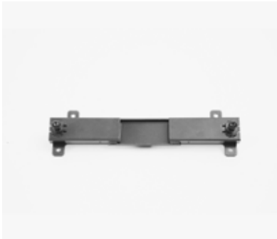
Armrest bracket E04, E08, E11