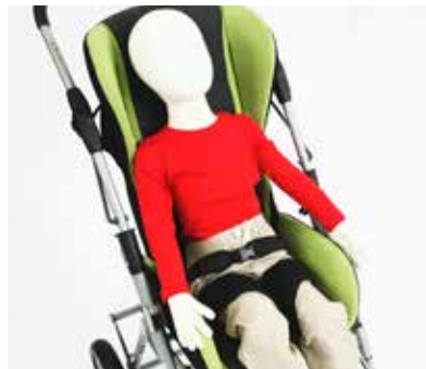
Pelvic harness A01-A02