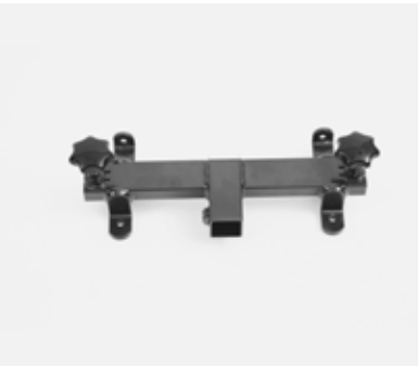
Combi-bracket E01-E05 Combi-brackets are standard on electrically powered chairs.