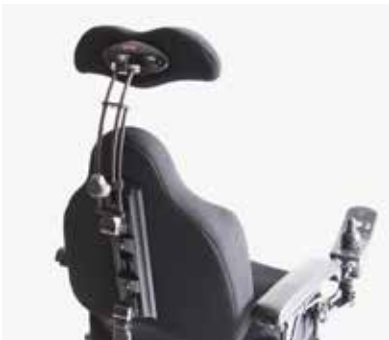
Head restraint, SitRite E02-E03, E07, E10