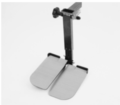
Complete/Partial foot plate E07, E09-E10