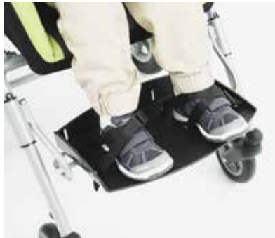
Foot strap 1.0 m A01-A02