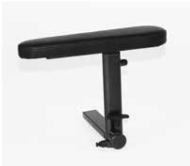
Armrest, folding E01-E05, E07-E08, E10-E11