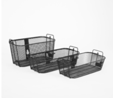
Steel basket V01-06, V09-V10