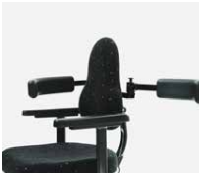
Trunk support E04, E08, E11