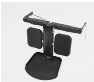
Complete electrical foot plate E07, E09-E10