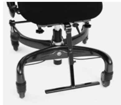
Foot rail E01-E11