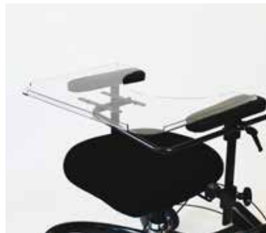
Acrylic table E01-E05, E07-E11