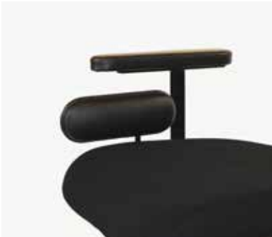
Thigh support E01-E11