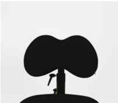
Forma basic, back E01-E03, E05, E07, E10