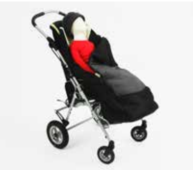
Travel bag A01-A02