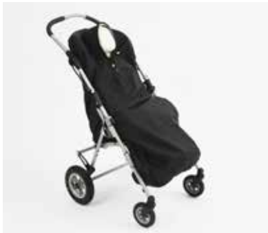
Rain protection A01-A02