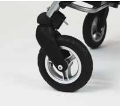
Direction inhibitor A01-A02