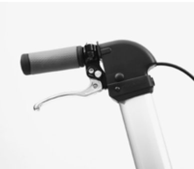
Single-handed brake V01-V07, V10