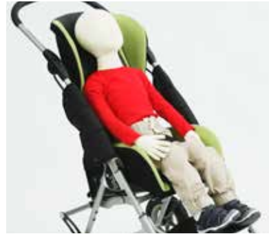
Side protection A01-A02