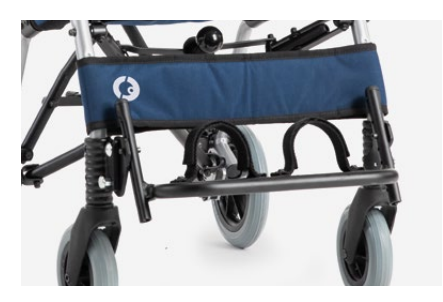
827 Foot straps