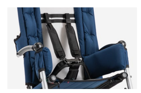
906 Five point harness