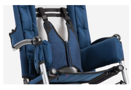
853 Vest harness