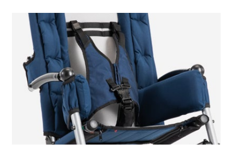
903 Five point vest harness