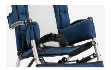
894 45° pelvic belt