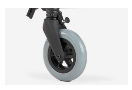
812 Directional locks for front wheels