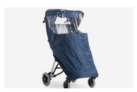
825 Rain cover to fix to the 819 canopy.