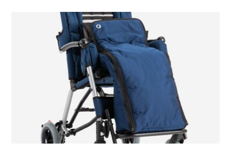
818 Thermal cover