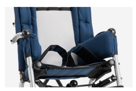
817 Leg straps for abduction